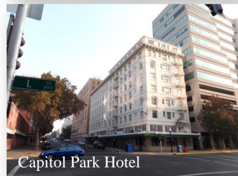
Capitol Park Hotel