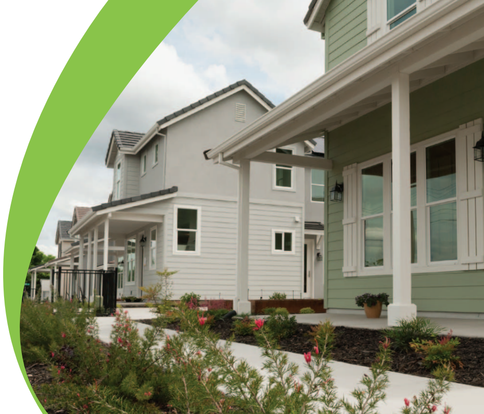
DEL PASO NUEVO DEVELOPMENT The completed Del Paso Nuevo development in North Sacramento will feature 300 high quality affordable single family homes. The benefits of the DPN project extend beyond the boundaries of the development into the surrounding community, including infrastructure, parks, commercial development and job opportunities.

SHRA provides funding, expertise and public-private partnerships to preserve, restore and revitalize housing and historic structures, creating new opportunities for residents and the community.