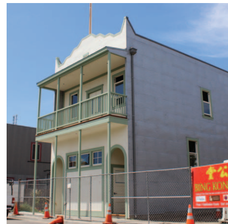
THE BING KONG TONG BUILDING RESTORATION The restoration of the Bing Kong Tong building in the city of Isleton is an important milestone in the ongoing efforts to highlight and preserve the historical, cultural and architectural contributions of the early Chinese settlers in the Sacramento River Delta. The building will be eventually used as a museum and community space.