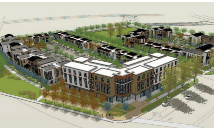
TWIN RIVERS HOUSING PROJECT We're completely redeveloping Twin Rivers, one of our oldest public housing communities in the River District-Railyards neighborhood, to create a vibrant community that reconnects the residents and surrounding area through housing, services, employment and transportation.