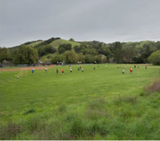
Detention Basin / Soccer