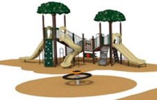
Tot Lot & 5-12 Adventure Play Areas