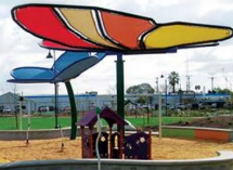
Butterfly Fabric Shade Shelters