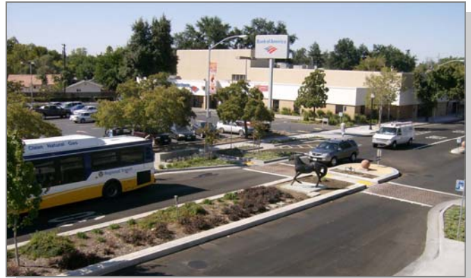
Del Paso Boulevard after completion of the $6.7 million streetscape beautification project.