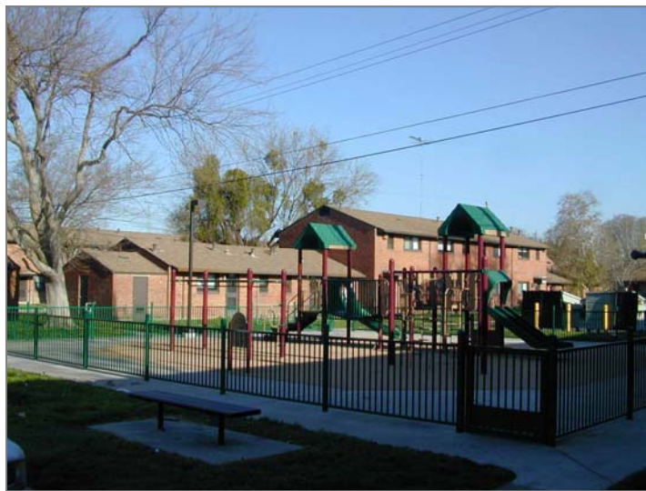
Alder Grove is one of several large housing communities identified as priority sites for Housing Authority asset repositioning that may provide high potential return on investment.

Officials emphasize implementation of a long-term asset repositioning strategy can take five to 10 years. In the short term, immediate strategies will focus on addressing single family homes, vacant lot sales and non-residential assets. A timeline for implementation is expected to be presented for review and approval by spring 2008.